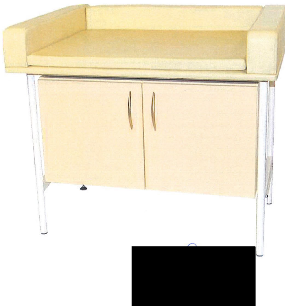
Table SBN-S01 is intended for baby care in clinics and doctors' offices. The table is made of powder-coated steel tubes and a cabinet under the lying surface (5.1.). The table has four stable, adjustable legs (5.2.). The tabletop is made of chipboard with padding. It is protected on three sides by 10 cm high side boards. The edges are padded and covered with synthetic leather resistant to disinfectants (5.3.). Under the changing table is a two-door cabinet made of laminated chipboard with an inner shelf (5.4.).